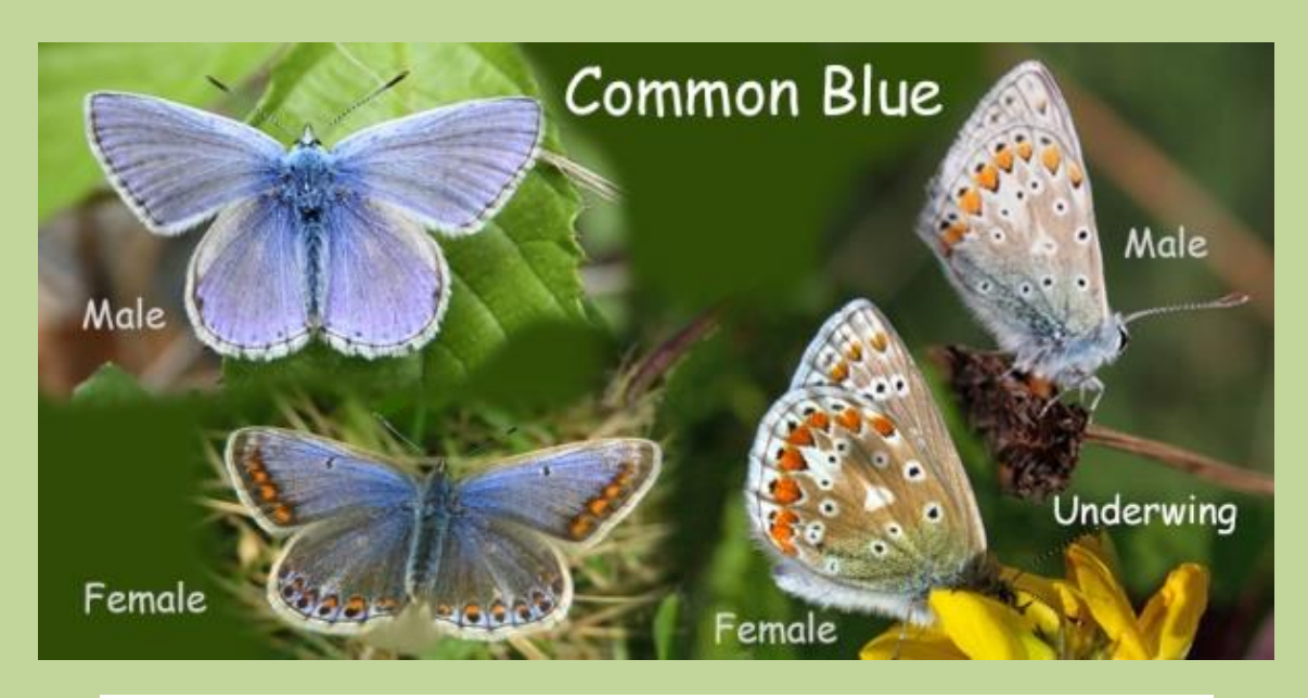
Common Blue Polyommatus icarus – usually seen from May to September