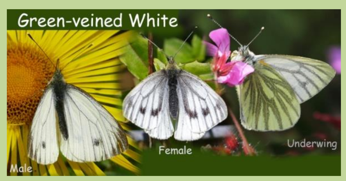
Green-veined White Pieris napi - usually seen from April to beginning of October