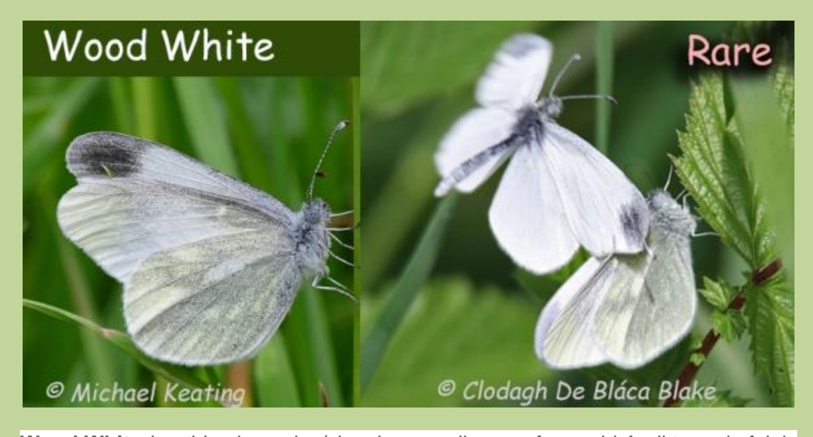
Wood White Leptidea juvernica/sinapis - usually seen from mid-April to end of July