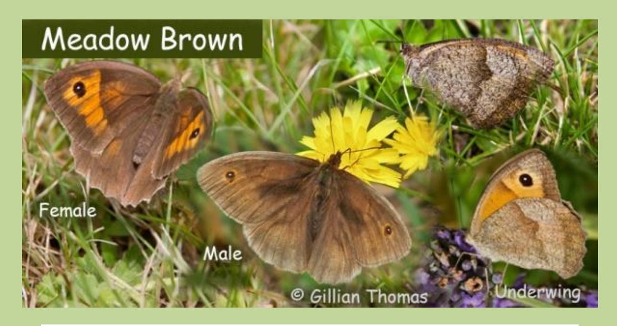
Meadow Brown Maniola jurtina - usually seen from June to early September