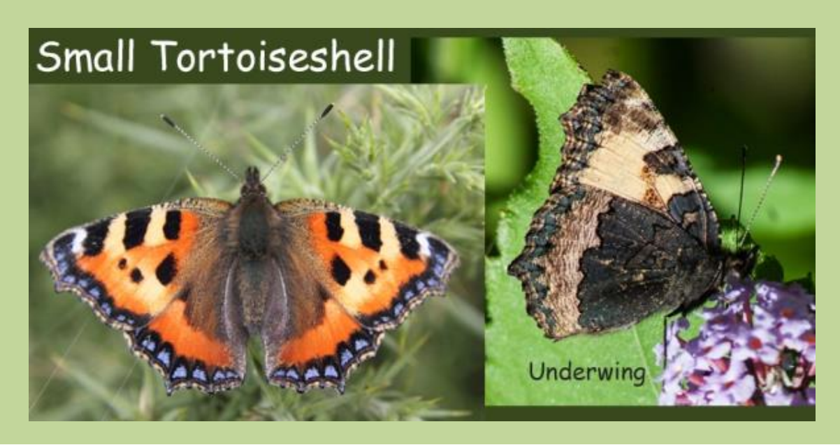
Small Tortoiseshell Aglais urticae - from mid- March to mid-May/July to the end of September