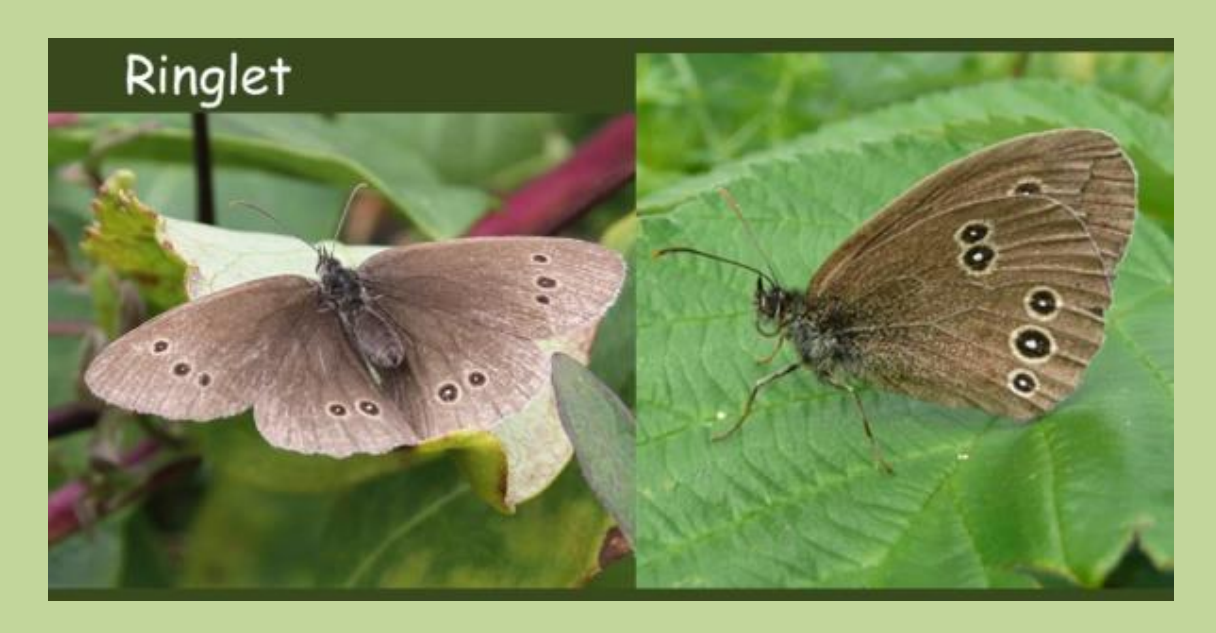
Ringlet Aphantopus hyperantus – usually seen from mid-June to early September