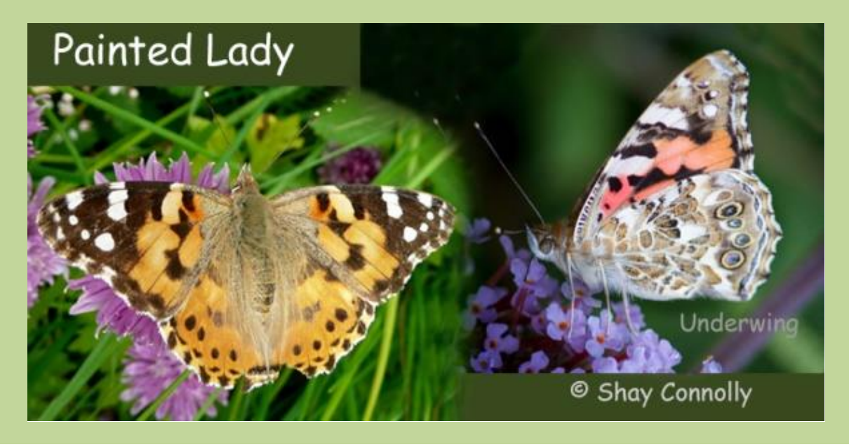
Painted Lady Vanessa cardui – usually seen towards the end of May/August and early September