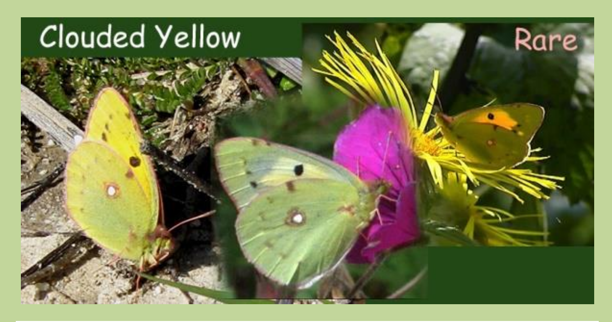
Clouded Yellow Colias croceus – usually seen from August to beginning of October