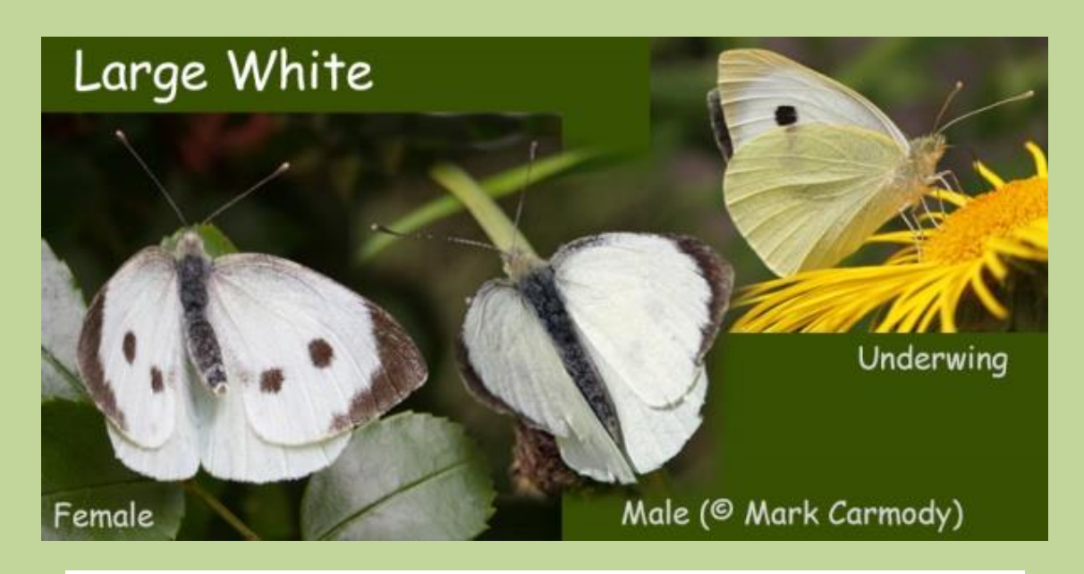
Large White Pieris brassicae – usually seen from April to beginning of October