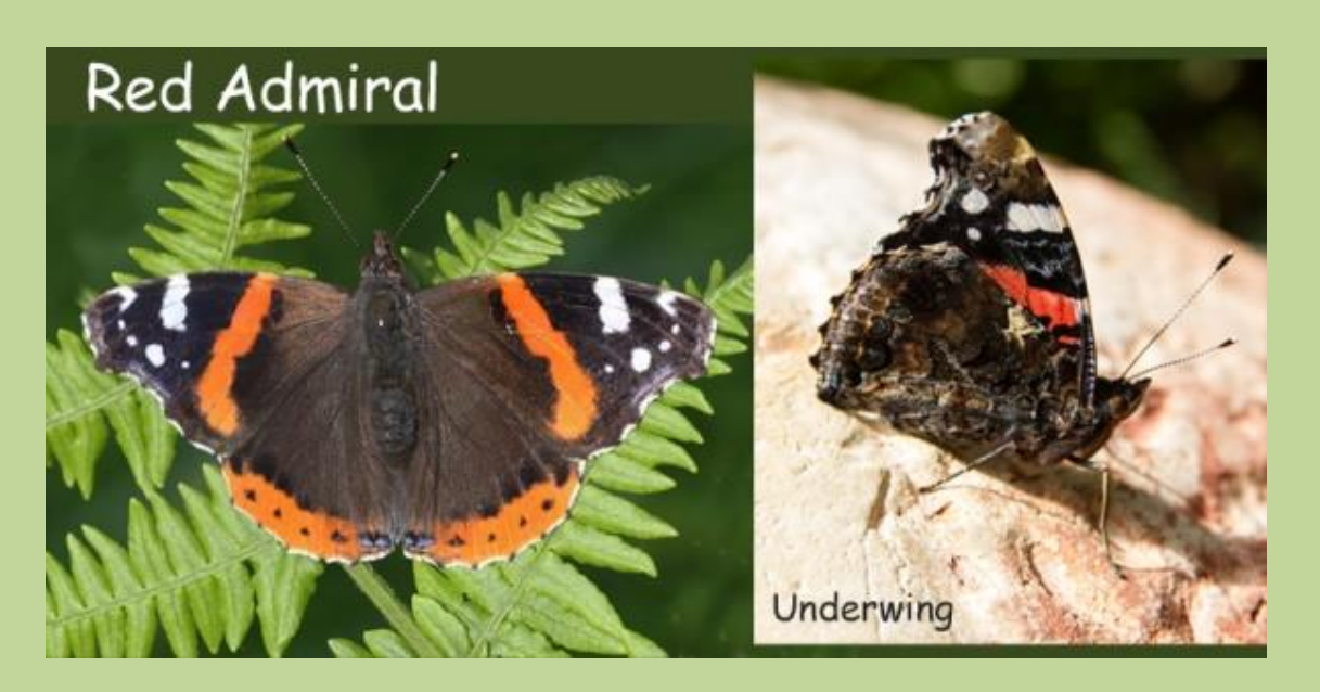
Red Admiral Vanessa atalanta – usually seen from July until late October