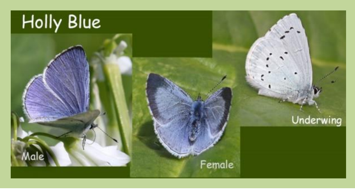
Holly Blue Celastrina argiolus - usually seen from mid-March until early June and again in August