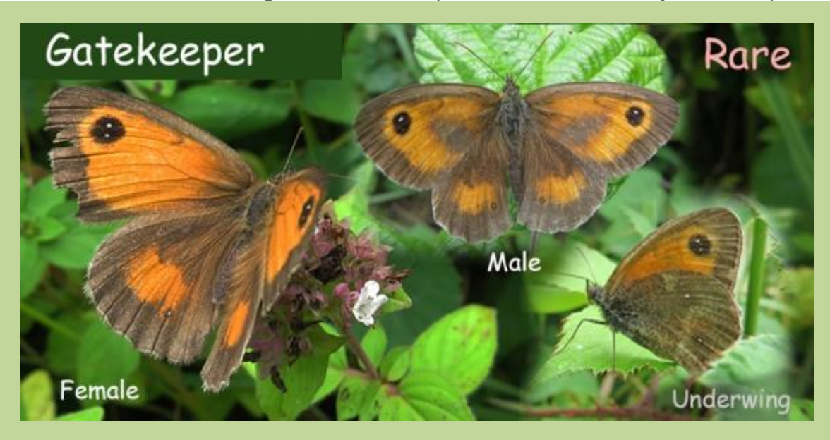
Gatekeeper Pyronia tithonus - usually seen in July and August