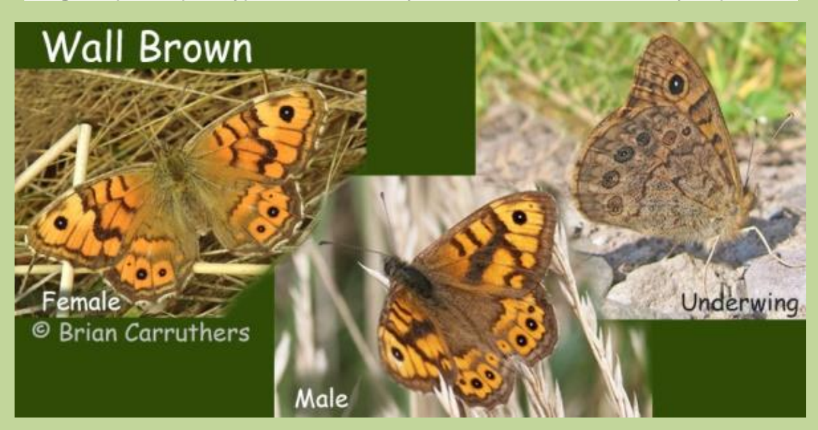
Wall Brown Lasiommata megera – from mid-April to mid-June/mid-July to mid-September