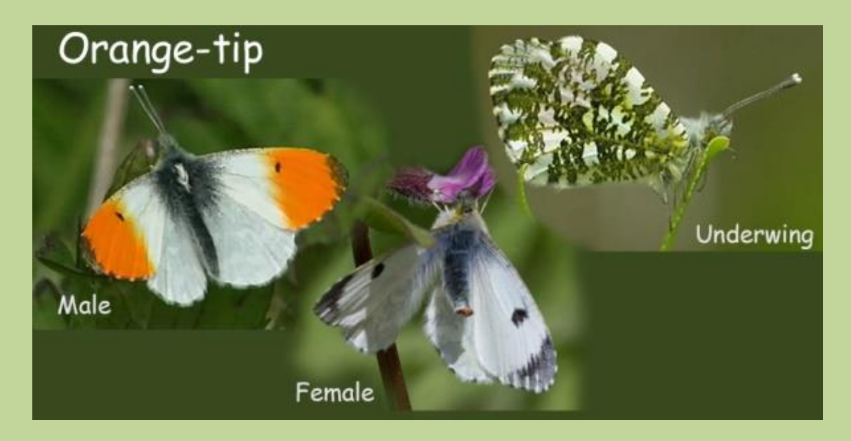
Orange-tip Anthocharis cardamines – usually seen from April to early June