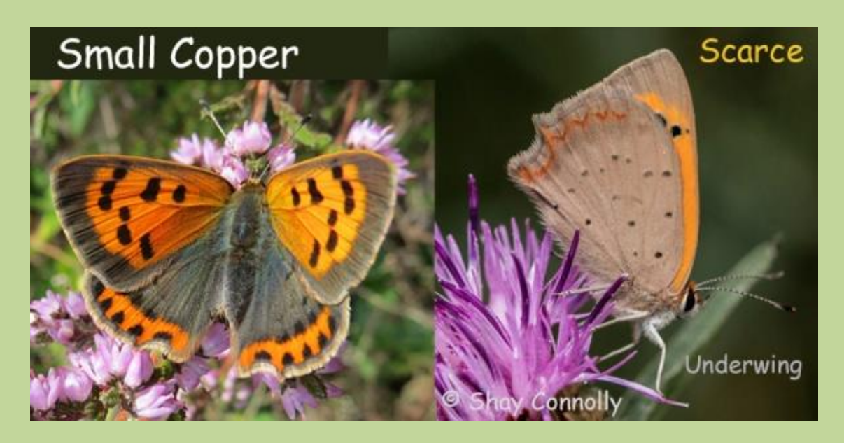
Small Copper Lycaena phlaeas – usually seen from mid-April to mid-September