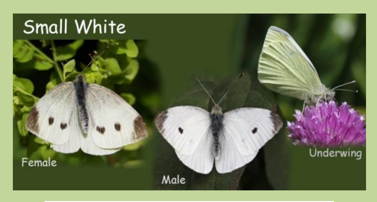
Small White Pieris rapae – usually seen from April to end of August